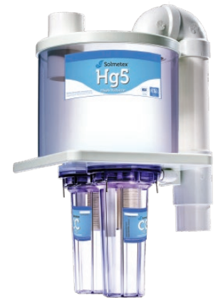
Hg5 High Volume Amalgam Separator