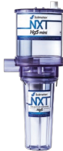
NXT Hg5 Mini Amalgam Separator

To order your Solmetex NXT Hg5 System, please contact your local dental product dealer. If you don't have a dealer, visit www.solmetex.com Click on "dealer locator" to find the dental product dealer closest to you or contact Solmetex for information at 1-800-216-5505 .