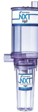
NXT Hg5 Amalgam Separator