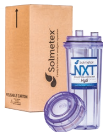
NXT Hg5 Collection Container