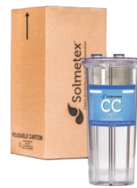
Hg5 Collection Container