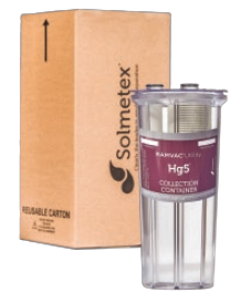
RAMVAC Utility Collection Container